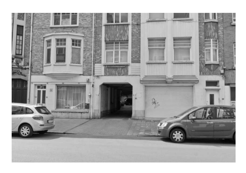
23-25 Avenue Auguste Rodin